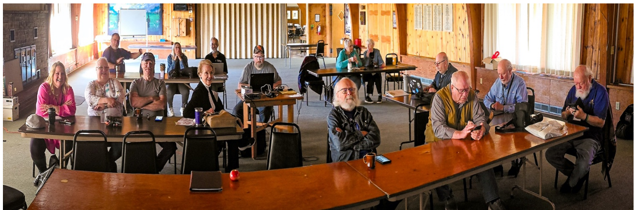
Attendees at the Wesley Woods Mini-Spring Convention in Indianola, Iowa