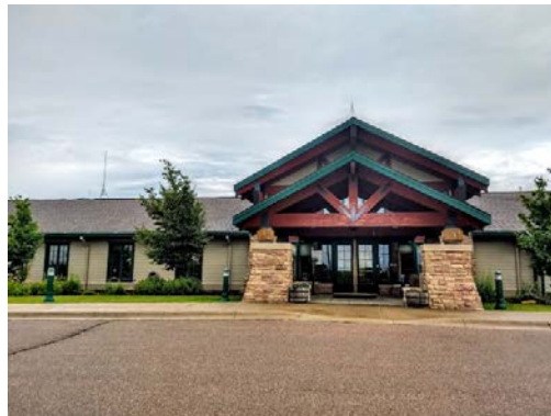
Welcome Center at Ponca State Park (Headquarters for the 2024 N4C Fall Convention)

White-tailed deer and wild turkey are commonly seen. Coyotes, and red-grey foxes and bobcats are often spotted. This area is also known for the concentrations of waterfowl that congregate during the spring and fall migrations. The barred owl is a vocal resident, and wintering bald eagles are often sighted.