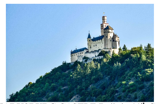
MARKSBURG CASTLE Built in 11th Century.