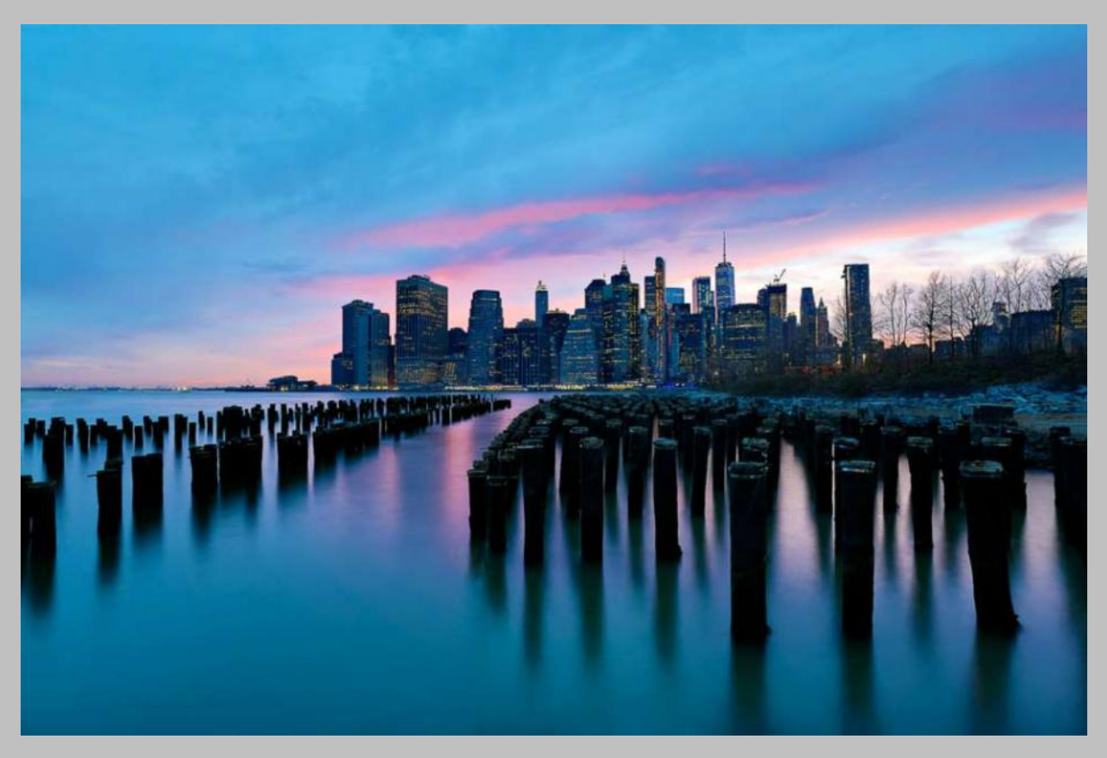
Digital Travel Diane Lowery, Des Moines Camera Club "NYC, NY"