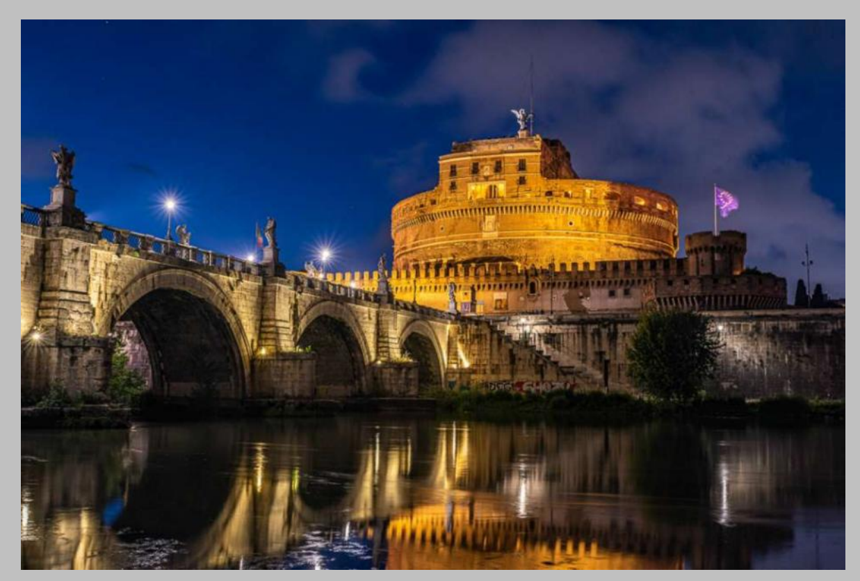
Digital Pictorial Al Kiecker, Minnesota Valley Photo Club "Castle San Angelo"