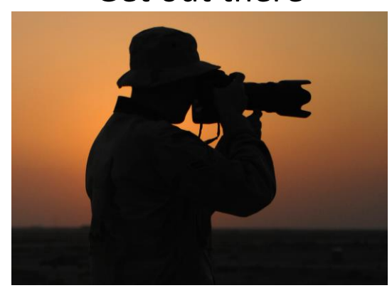
with your camera!!