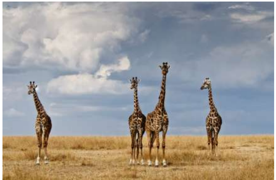
2014 Springbrook Presenter of Safaris in East Africa