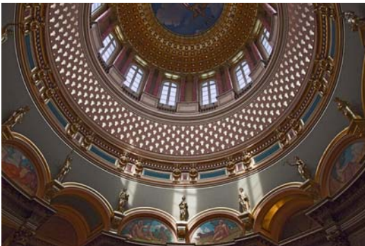
Friday morning we visited the state capitol building. At noon we had a box lunch at the Botanical Center and photographed the flowers and view points until 3:00 p.m.