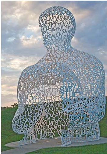
The Des Moines Camera Club hosted the 2012 N4C Convention.