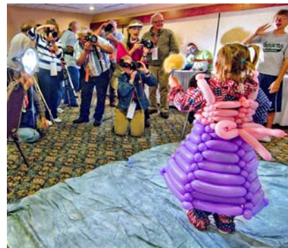
An example of Shari's Balloon Art